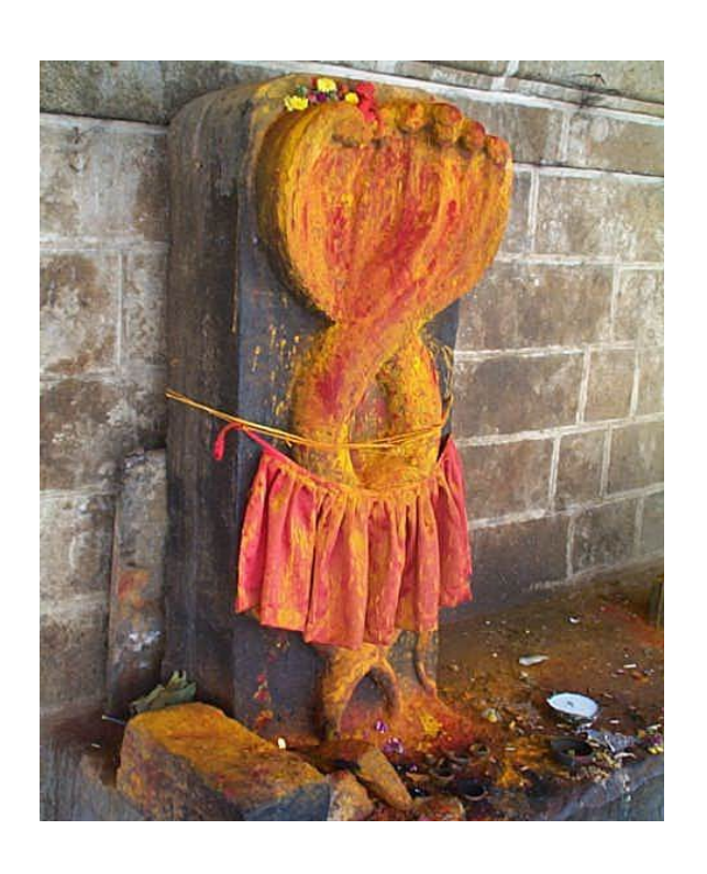
On site Investigation

Energetical Roots of Fundamental Experience South India