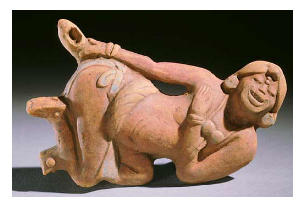
Guatemala Escuintla Maya culture, Escuintla, Middle-Late Classic periods, A.D. 400-850

In the New World another system of administering a honey based drug was used particularly by the Maya. Archeologists excavating Mayan tombs turned up tubes (of rubber?) whose function was unclear. Paintings found on a number of vases illustrate in detail the use of these tubes. One illustration shows a recumbent figure with his legs spread. He is receiving an enema which is being administered by a person (woman?) standing beside him holding a container connected to a tube. There is also another male ladling enema fluid out of a large jar. Another painting of this kind shows an attractive young woman (goddess?) removing the clothing from a to a male (god?). In front of her are the enema container and what looks like a rubber enema bulb syringe. Besides paintings there is even statuary with the same theme.